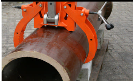
"KRABBE" holding tong KRZ 250-500